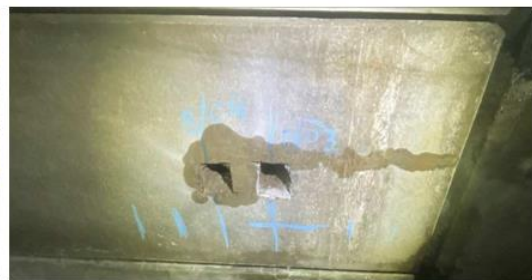
Images of the recent intrusive investigation of the half joint structure